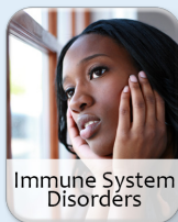
Immune System Disorders